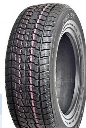
A table of KAMA-365 (HK-243) light truck tire technical characteristics compared with analogue KAMA-218 tire